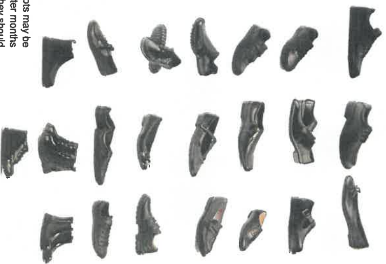
Black ankle boots may be worn in the winter months with trouser. They should not be worn with dresses/skirts