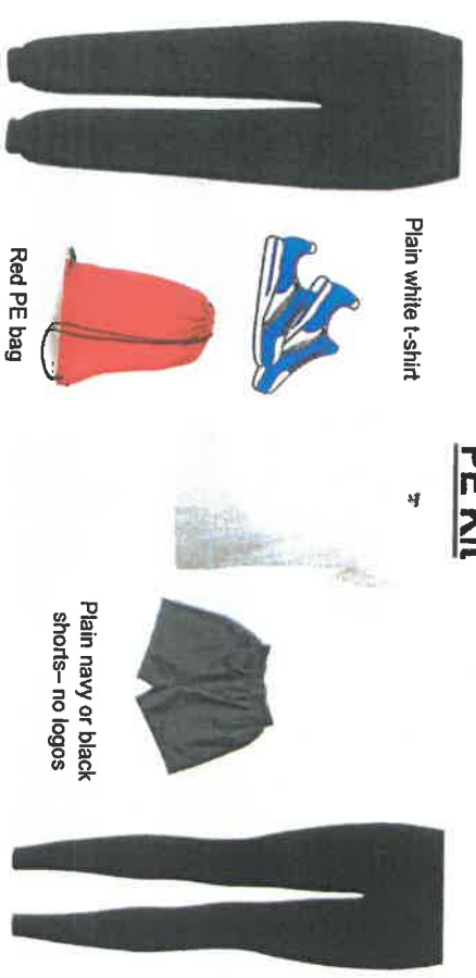
Plain white t-shirt